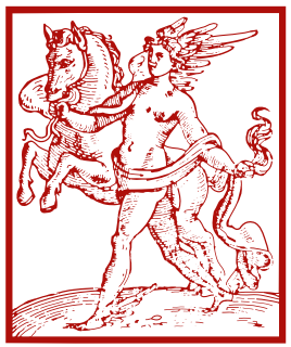
FONDAZIONE INTERNAZIONALE MENARINI